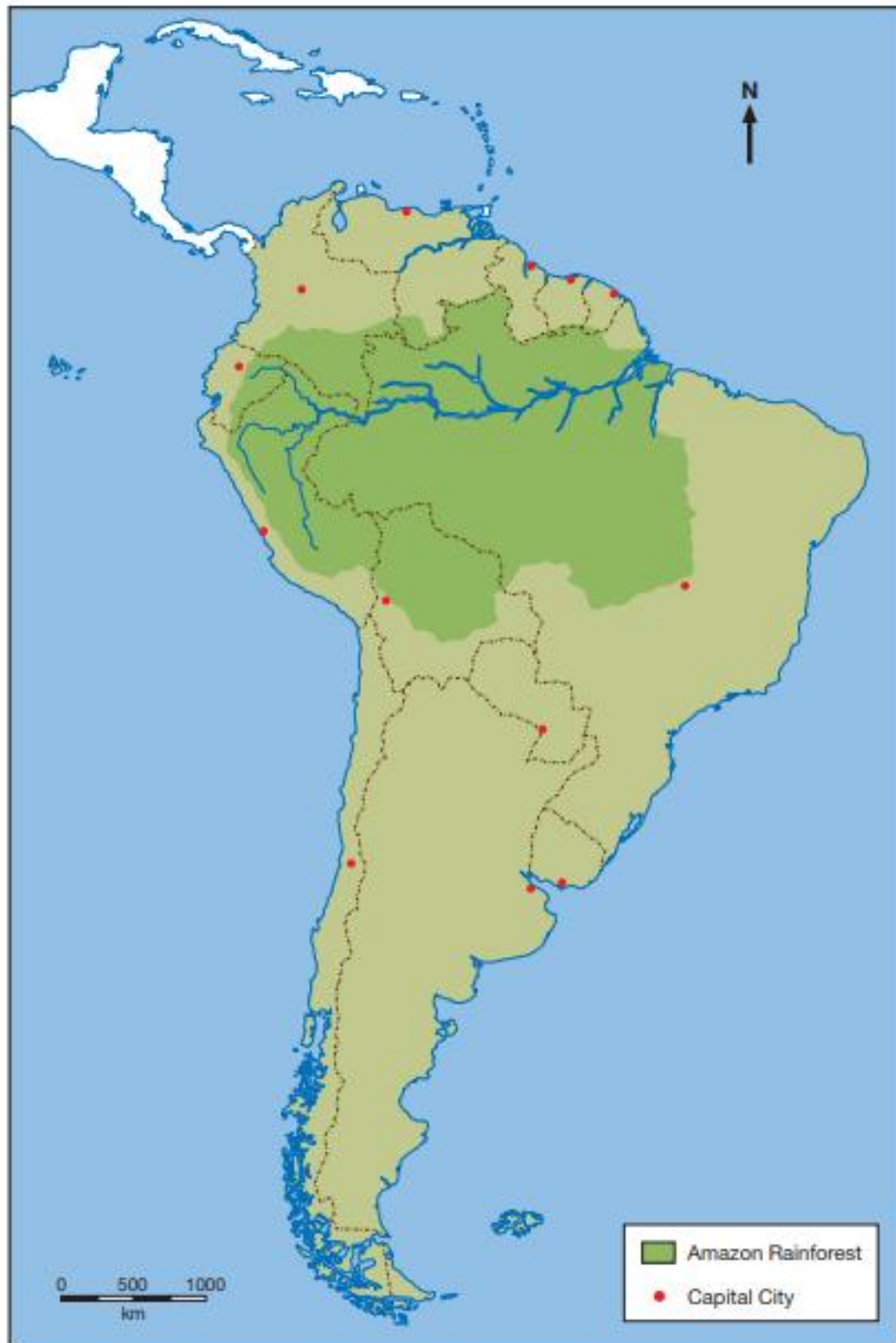
Map 1: Map of South America